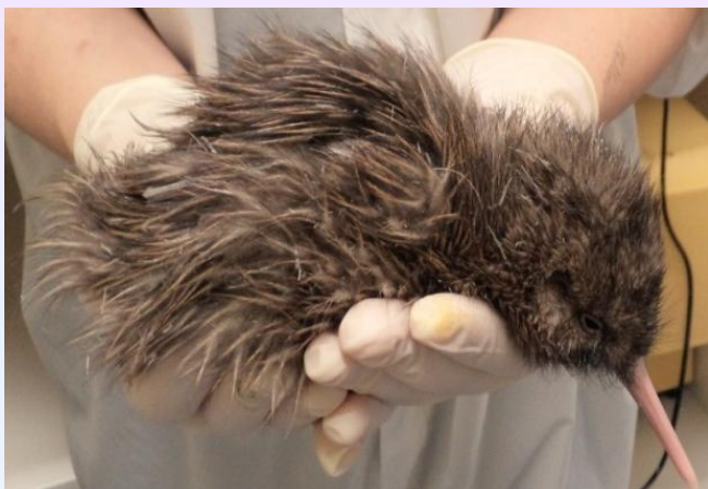
Here is Tipu 12 hours after hatch! He looked like one very tired little chick, as his feathers began to become dry and fluffy!

We are currently incubating 1 Rowi egg, which is 60 days old. This egg weighs 374 grams, which is just below the average of 400 grams. The egg is looking very well, and we expect the little chick inside to hatch on the 16 th of February!